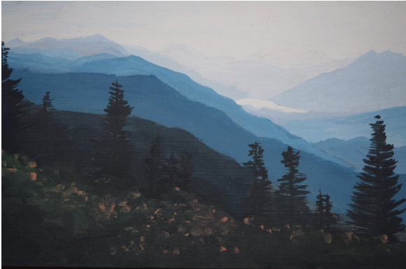
Painting by Dan Clegg

ADMISSION: $5 per person or $20 per car load. Tickets at the waterfall at 47846 Elk View Rd.